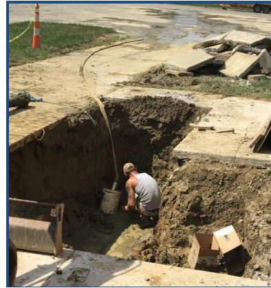
Money spent for major repairs rather than new technology